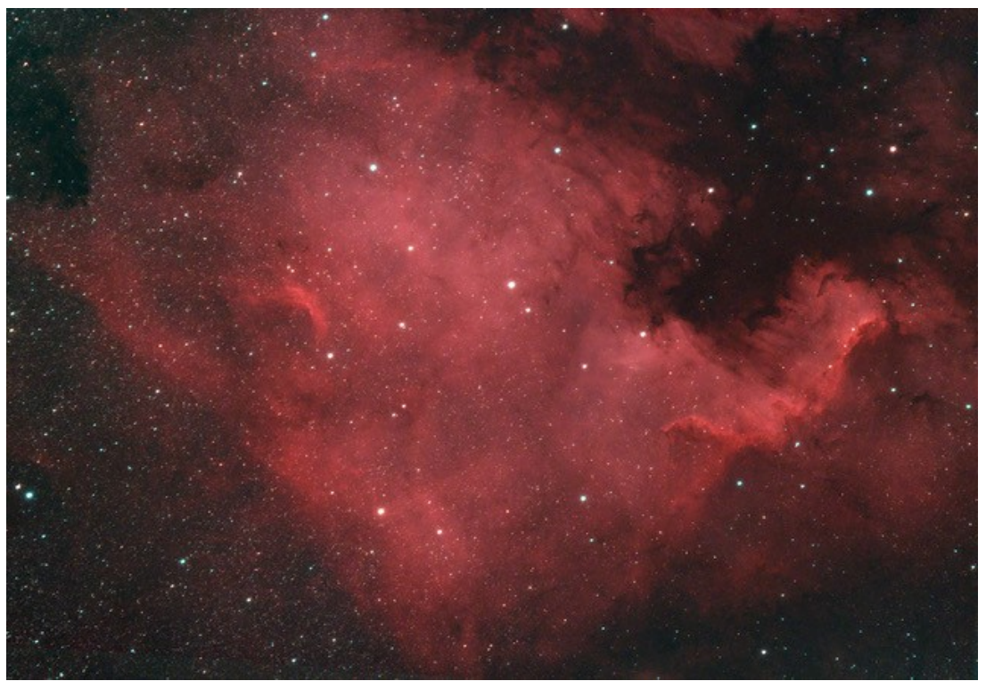
Same NGC7000 taken on November 1-2, 2020 using a WO Z73 with a ZWO ASI071MC-Pro camera on a HEQ5 mount. The stars are not purple.....