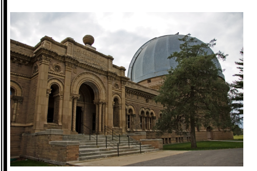
Yerkes Observatory, Williams Bay, WI