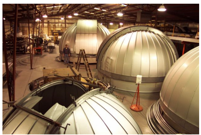
The completed and assembled Peoria Dome awaits delivery in the Ash Dome facility in Plainfield, Illinois