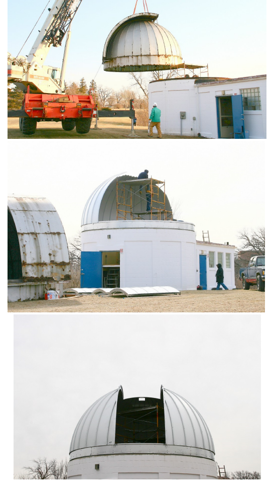
By the time you read this, the new dome will be complete!

We'll be back in business in late March, just in time for 100 Hours of Astronomy, April 2-5, and our summer season reopening on May 2. Many years of preparation resulted in a beautiful new dome.